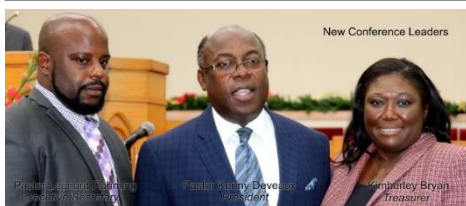
New Conference Leaders